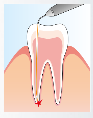
Endodontics Canal bacterial reduction, Tubuli bacterial reduction, Gangrene treatment