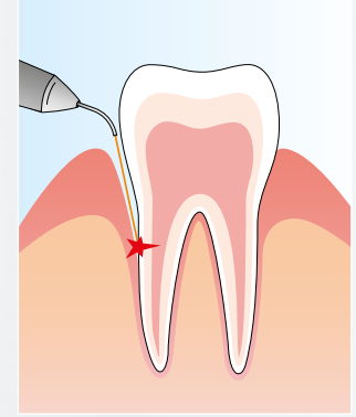
Periodontology Pocket bacterial reduction, Removal of granulation tissue