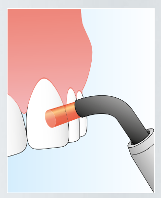
Laser bleaching Flash activation of O<sub>2</sub> radicals, Optimised treatment time, Gentle on the teet, Better results